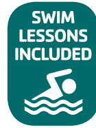
ROCKLAND TRUST SPLASH PARK COMING SPRING 2016!