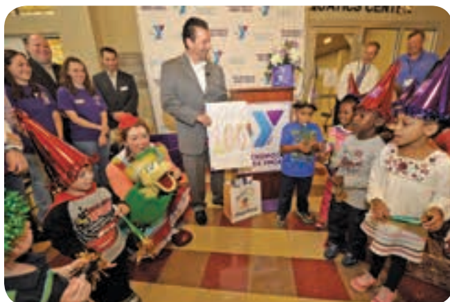
Children from our Invensys Foxboro Branch Early Learning Center sing Happy Birthday to representatives of Stop & Shop in honor of their 100 th anniversary