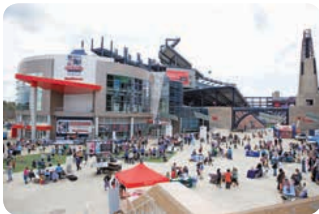
Families have fun during the 2014 Healthy Kids Day at Patriot Place