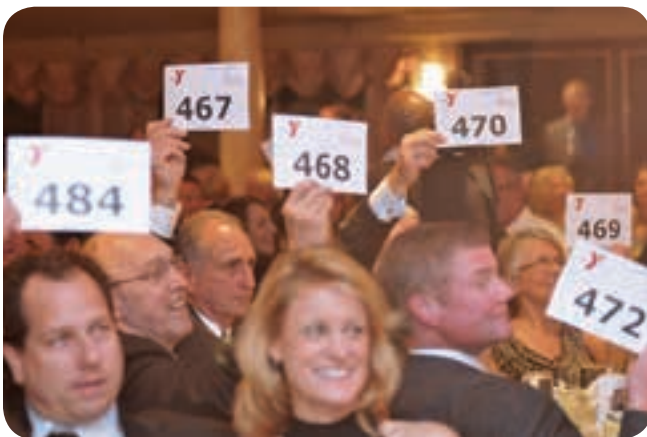
Thoughtful, caring Y supporters make a difference at the 2014 Legends Ball