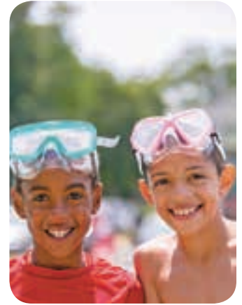
Summer campers enjoy daily swim lessons