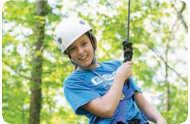
Summer campers enjoy the high ropes course through the bullying prevention program, Adventures in Respect