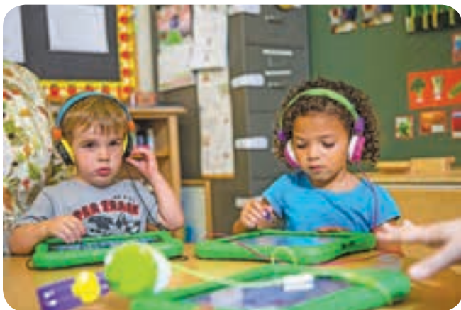
Children enjoy a lesson as part of the iPad Technology Initiative in our Early Learning Center